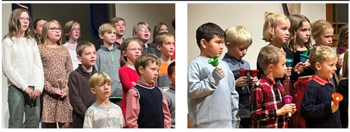
Our Covenant kids once again shared the good news of Jesus' birth through their Christmas Program on December 15. Thank you to all of them for speaking, singing, and ringing out the good news!