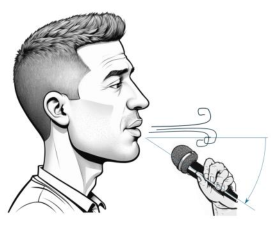
Illustration: Correctly holding a handheld microphone

Whether you're sharing during prayer time or making an announcement, knowing how to hold a microphone can make a world of difference. It might seem simple, but many people make common mistakes. Here's how to get it right: