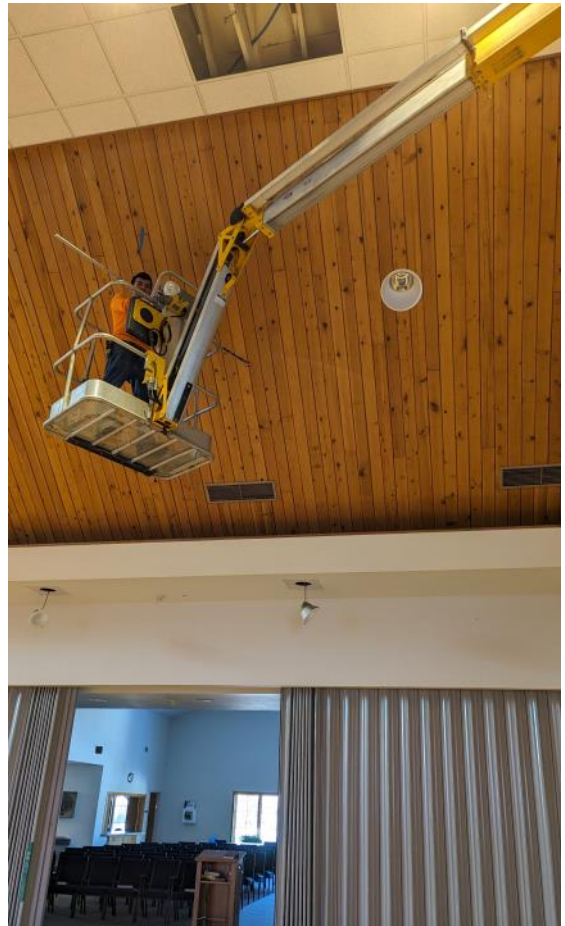
The sanctuary remodel is progressing! Lights are going in, steps for the platform are being re-constructed, the drywall is in, and mudding and taping is getting done!