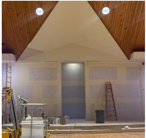
We are excited to see the progress and can't wait to worship in the sanctuary again!