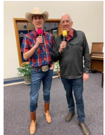
Anyone remember these fantastic auctioneers from the auction in 2022???

The Christian Education Committee is excited to announce the return of our church auction on Friday, February 23, 2024. There is no doubt in my mind that we will once again have a night filled with laughter, outrageous bidding, amazing items, and delightful fellowship. It's not too early to begin thinking of items to put on the auction! Some of our more popular items over the years have been themed dinner parties, artwork, and hand crafted items. Kids and young adults—don't be afraid to offer babysitting, plant watering, or pet sitting services. Or maybe you have a great recipe to share! Some baked goods auctioned off over the years have included bread, cinnamon rolls, and cakes. Perhaps you have a skill you can offer to teach someone? We would love to have a wide variety of auction items that will allow for people to give as they are able. At the beginning of January we will have both a google doc and a physical sign up sheet in the back of the church for you to indicate what you will be contributing to the auction. Thanks for all the ways you give to Christian Education!