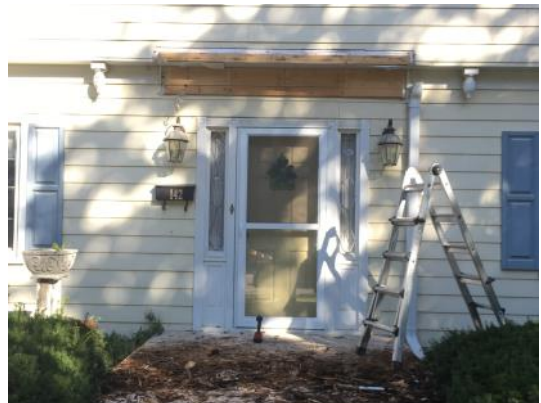
The Building Committee has been hard at work doing some "de-construction" on the parsonage. Watch for some "re-construction" to come!