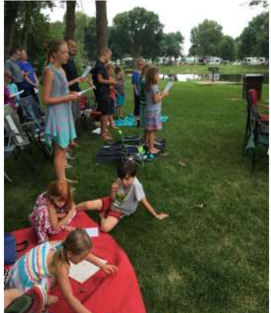
Outdoor worship service and picnic at Sandy Hollow.