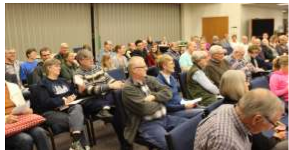
Thank you to everyone for donating, for attending, for bidding, and for bringing your checkbook in order to support the Christian Education Fund!