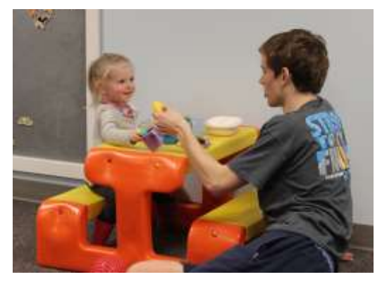
Thanks to the youth group for caring for our kids during the Christian Education Fund Auction!