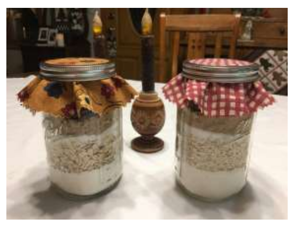
Here's a prototype of the cookie jars that will be assembled on January 30 and shared with Covenant's neighbors.

-reprinted from the Justice For All newsletter