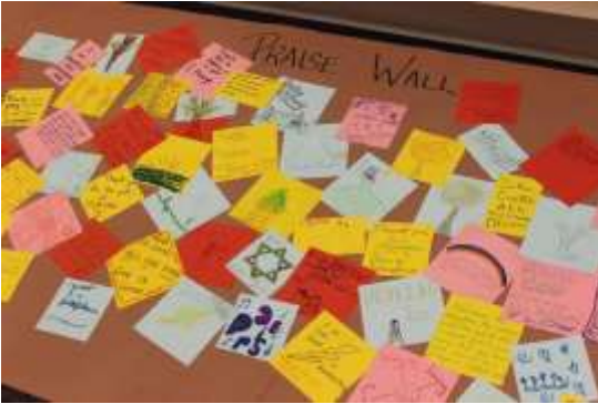
The WE service on October 20 included prayer centers around the Lord's Prayer.