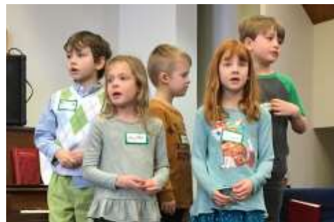
Thank you for sharing your gift of song!