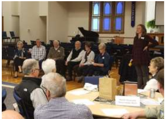
Our panelists prepare to answer questions from the Sunday

Zees in our church directory are Themistols and Castelans and Felicianos, Buckinghamhs and Hawleys and Stevensons.