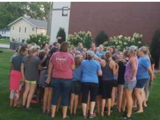
Top right: Participating in mixer games. Middle: Working on making theme t-shirts. Bottom: Covering the 4th graders in prayer.