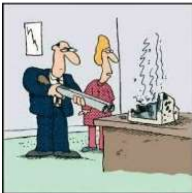
"There are better ways to log off."

the scenes it's been a bit rocky this year. I was delighted at the beginning of this year that the deacons got a new, faster computer for the church office which has