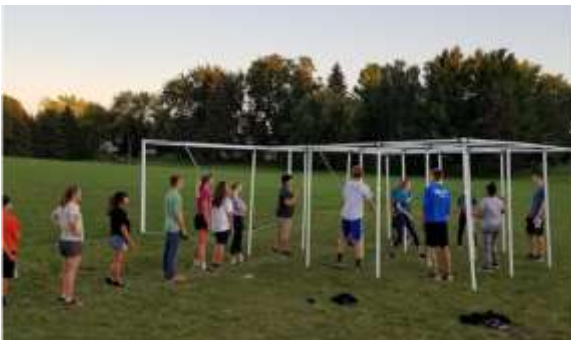
Covenant and Amistad youth playing 9 Square.

So far in 2017 we have focused on a couple of areas. For our discussion nights, we have been working through the book “Generous Justice” by Timothy Keller. The book walks through Keller’s thoughts on what justice looks like when empowered by and directed by the Bible. Our goal is to work through the book by the end of our year.