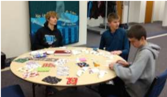
The domestication of the American male.

Also coming up at the end of November is a meeting where we invited several members of