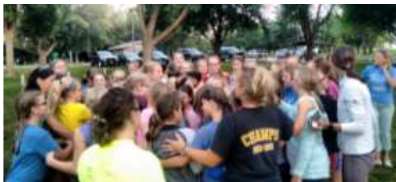
The GEMS kick-off in Children's Park. They roasted hotdogs and s'mores and made theme shirts.

tions, attitudes, and even where and how we step will be transformed. Thank you for your prayer support for each girl and counselor who are part of our program.