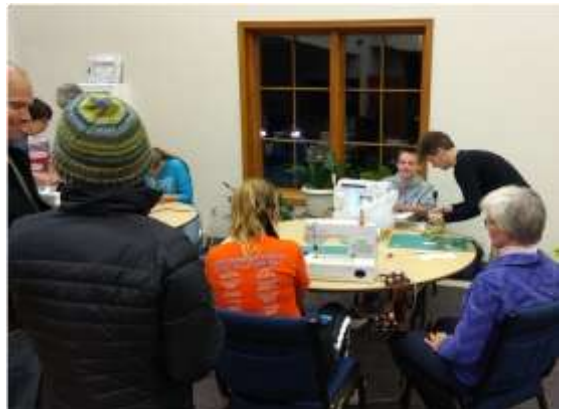
The Youth Group helping (and learning from) the Covenant Quilters.