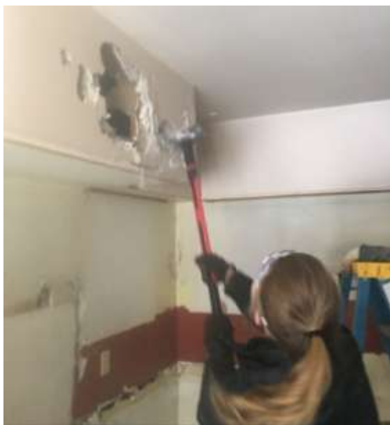
Below: Do we trust our youth group with sledgehammers? Apparently!