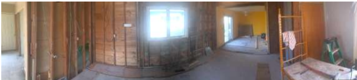
Above: Demolition is finished and we're left with a clean slate for the new kitchen!