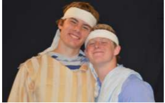
Some WE Service photo booth fun.