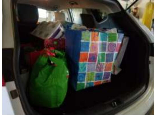
Gifts for the Mid-Sioux baskets.