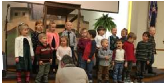
Thanks to the Children in Worship and the Sunday School kids for sharing the Christmas story with us at the Christmas program on December 11!